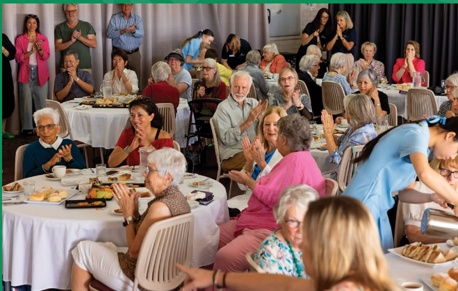
Seniors Morning Tea at Mosman Park Bowling Club

Tickets were drawn for spot prizes which ranged from a $100 voucher donated by Woolworths Cottesloe, a Garden Hamper donated by Bunnings Claremont along with various pot plants.