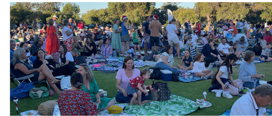
Peppermint Grove residents, friends and family relaxing while enjoying Carols