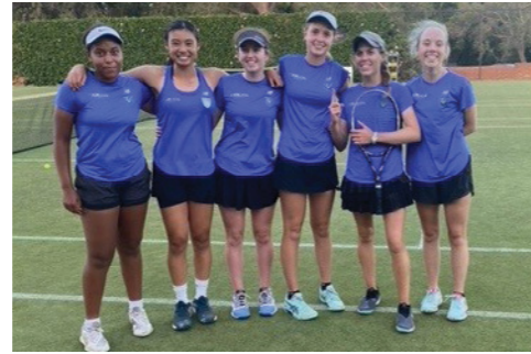
PGTC Division 1 Winning Team