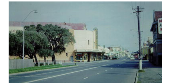
Intersection of Leake Street and Stirling Highway, looking south. Cottesloe Picture Theatre on the corner. Image donated to the Grove library by David Birkbeck, 1960s.