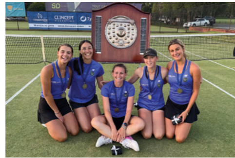
PGTC State League Winning Team

The Club is thriving and has experienced a very busy and successful summer pennant season, with the club fielding 17 women pennant teams, 5 men's, 2 mixed and 12 junior teams. Grand final pennant shields had also been won by PGTC's Div. 2 Mixed, Div. 5 Men Wednesday and Div. 4 Women Thursday teams.