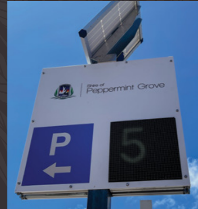
Digital Parking Sign at The Grove