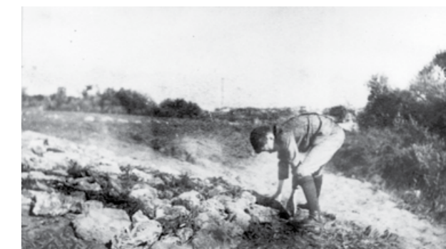
1900 A young boy repairing Forrest Street by hand

There was some embarrassment when it was realised two members of the delegation had a vested interest in the outcome, as they lived at opposite ends of