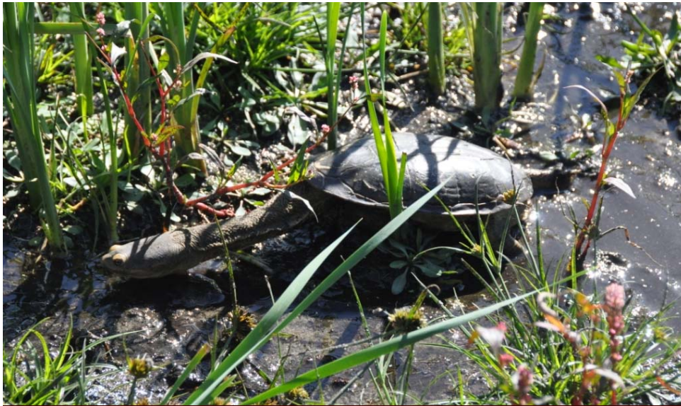
A Long-neck turtle

“Feral animal control is a really good example of councils working together on an issue that crosses our boundaries”.