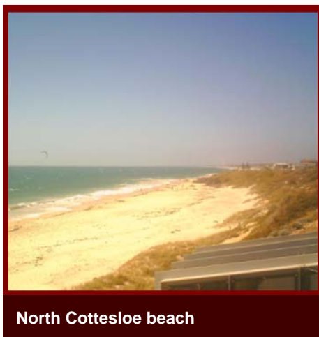
North Cottesloe beach

The Cottesloe monitoring project will also provide important information to a range of local government authorities along the coast.