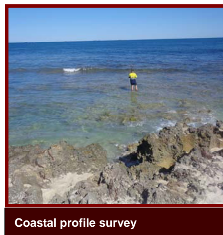
Coastal profile survey