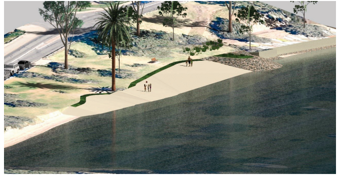
NB: Drawing is an artist impression only and is not to scale.

Specific actions include construction of a limestone headland to slow down sand loss, revegetation works, realignment of the stormwater drainage system, and reinstatement of the beach. As a guide, similar works have been completed recently at the South Perth foreshore to good effect. Reflecting our shared stewardship in this matter, this will be a 50/50 funded